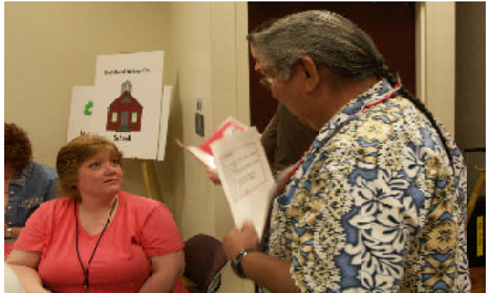
Participants in Conference