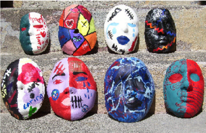
Masks designed by youth (See page 4)