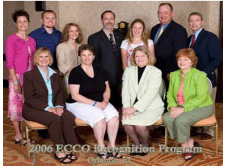
Idaho System of Care staff and partners accepting ECCO awards